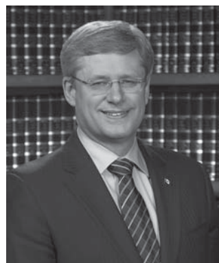
The Rt. Hon. Stephen Harper, P.C., M.P.

On behalf of the Government of Canada, I wish you all a most enjoyable and productive session of deliberations.