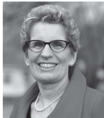
Kathleen Wynne Premier

A handwritten signature in black ink that reads "Kathleen Wynne".